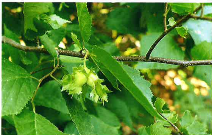
American Hazelnut —bare root, 24-36 inches