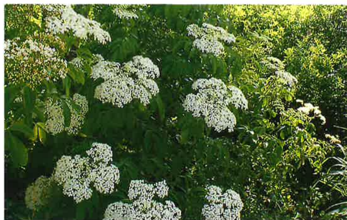
Elderberry —bare root, 18-24 inches

This nut-producing shrub bears abundant crops of small, sweet hazelnuts. Expect nuts 2-3 years after planting. The nuts are easy to crack and drop free of the husk when mature. Excellent for mammals, birds, and people! The shrub's winter-time male catkins also serve as a staple food for grouse. Requires well-drained soil and full/partial sun. Grows to a height of 15–18' and a spread of 10–12' at full maturity. Sold in bundles of 10/$20 each.